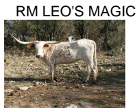
RM LEO'S MAGIC