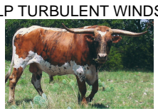
LP TURBULENT WINDS