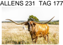
ALLENS 231 TAG 177