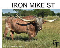
IRON MIKE ST