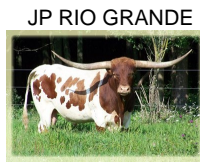
JP RIO GRANDE