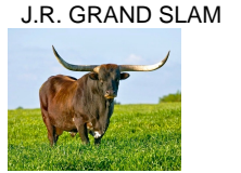
J.R. GRAND SLAM