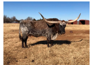
HUNTS COMMAND RESPECT