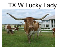
TX W Lucky Lady