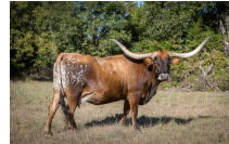
HORSESHOE J INNOVATE