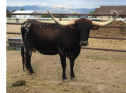
PCC BROKEN ARROW