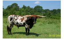
HUNTS MUTUAL RESPECT