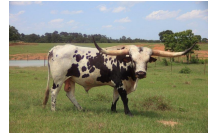
RIO BRAVO CHEX