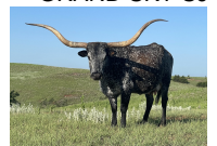
GRAND SKY SJ