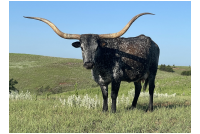
GRAND SKY SJ