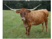
HORSESHOE J FOUNDATION